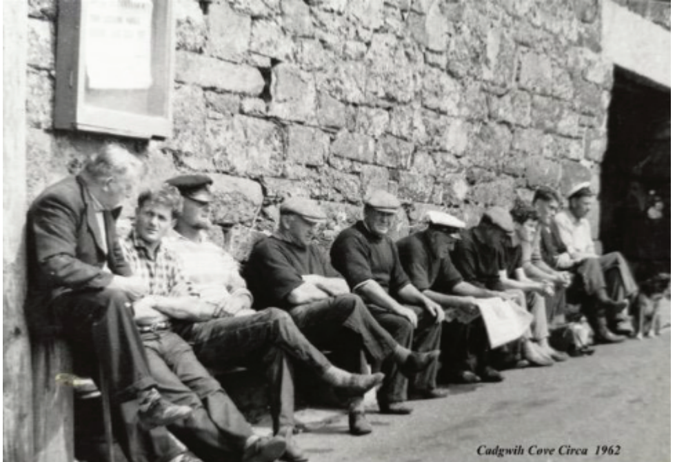
Cadgwith Cove Circa 1962